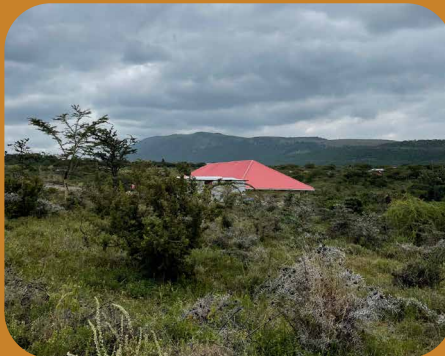
Scenic Natural Landscape

The Conference Centre seeks to create improvements in the socioeconomic conditions of its target beneficiaries (women, youth, and persons with disabilities) by collaborating with various community groups to deliver essential services