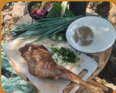
Fresh, organic Maasai Food