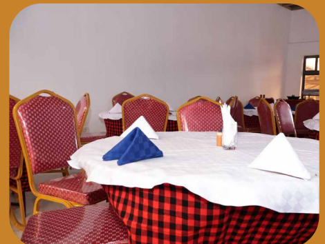
Meeting and dining halls